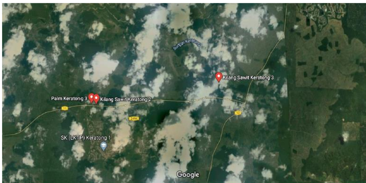
Map Showing the Location of Certified Unit

2 km