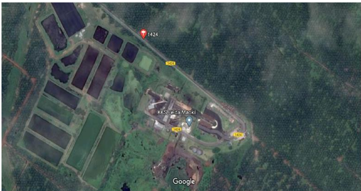
Map Showing the Location of Certified Unit

100 m